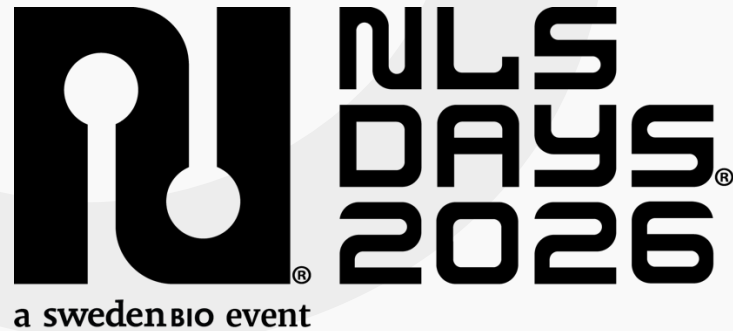
NLSDAYS LOGO – HORIZONTAL With dates and venue