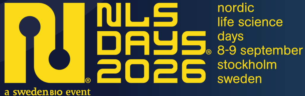
NLSDAYS LOGO – HORIZONTAL With dates and venue