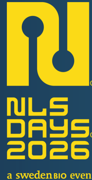
NLSDAYS LOGO – VERTICAL