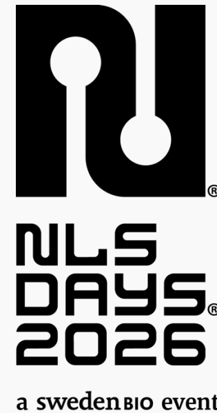
NLSDAYS LOGO – VERTICAL